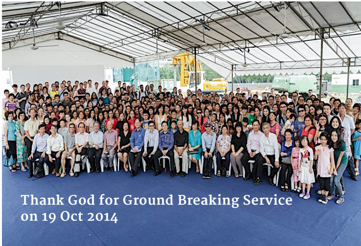
Thank God for Ground Breaking Service on 19 Oct 2014