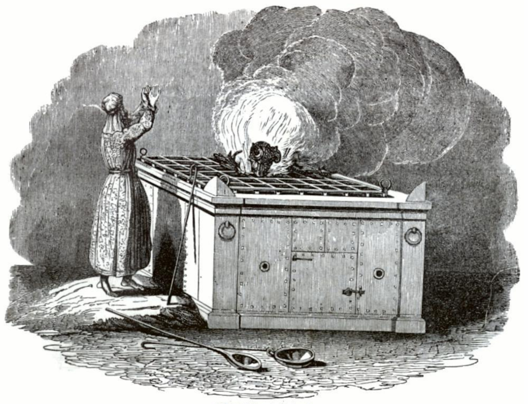
(Altar of burnt-offering.)