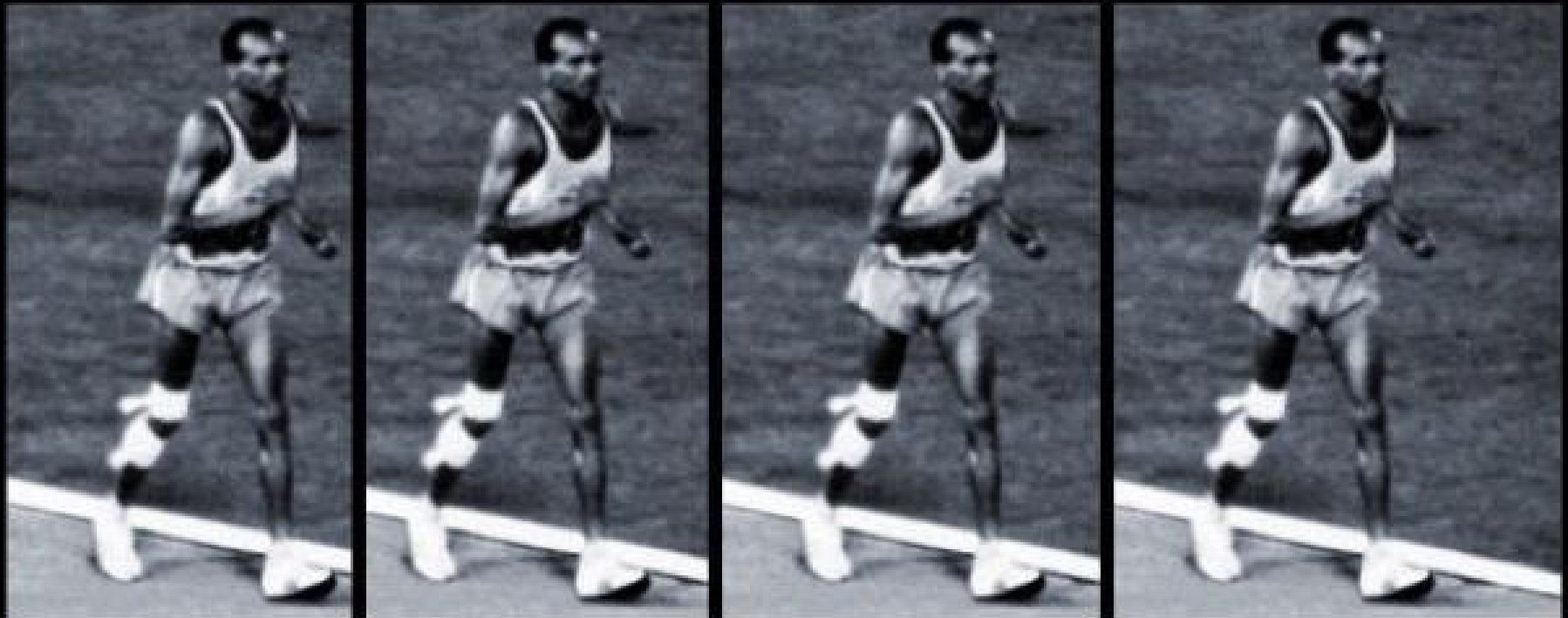
The greatest last place finish ever