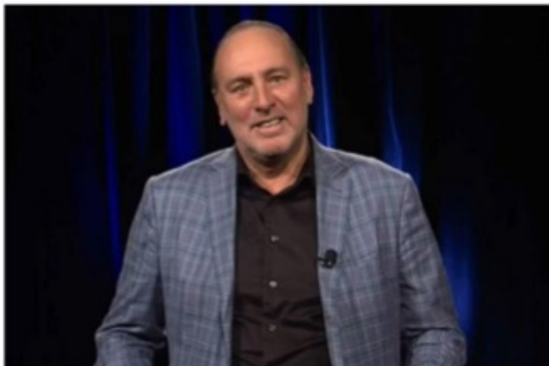
Hillsong founder Brian Houston was accused of spending lavishly on luxury retreats, designer goods, private jets and custom skateboards.