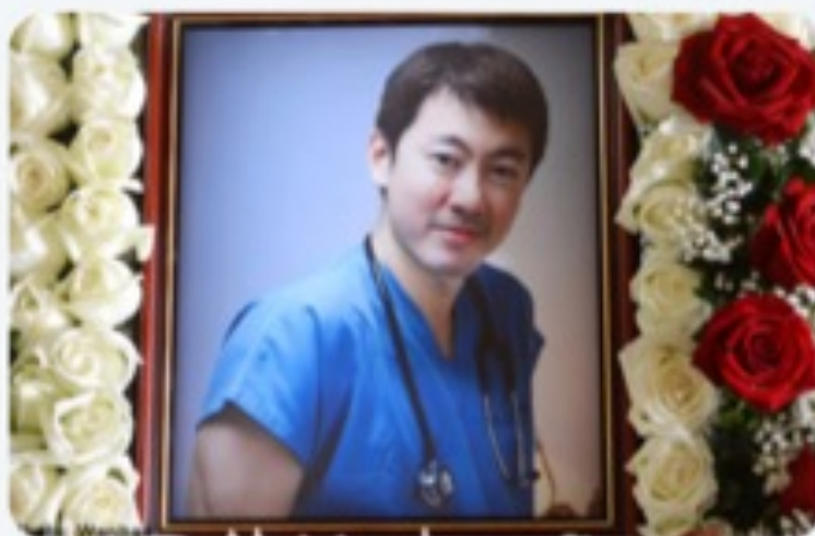
PHOTO: Late millionaire surgeon's last words on money, Ferraris, and true joy