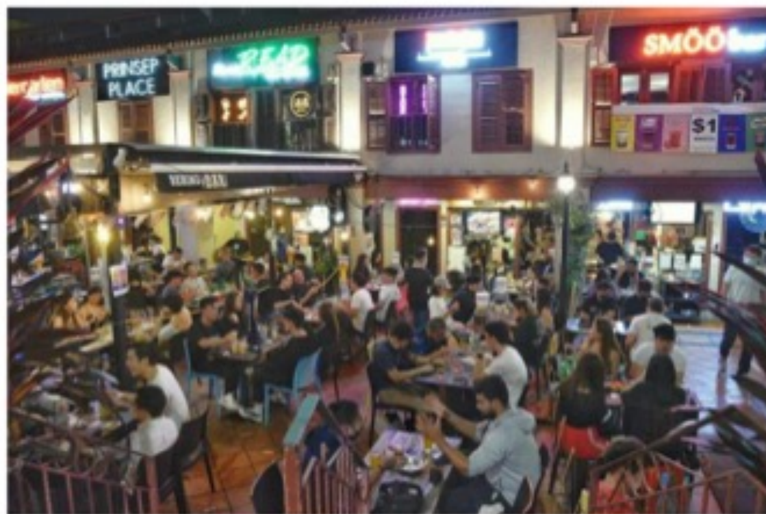
The pair racked up an unpaid bill of over $2,000 at five restaurants, say the police.